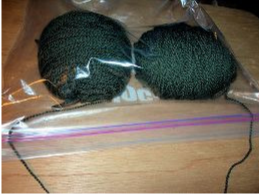
Yarn in Ziploc bag (3)

I place my bag of yarn in my lap. With opposite end of needle #1, knit wraps of first sock off left tip of needle #1. (Picture 4)