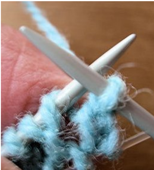
Left needle under bar from back (11)

Raised Bar or Running Yarn Right Increase: Yarn as it travels between two stitches is referred to as a bar or running yarn. From the back, go under bar with tip of left needle and catch bar. Insert right needle tip from the left under the left leg of bar at front of needle, forming a loop. Knit loop off left needle. (Picture 11 and 12)