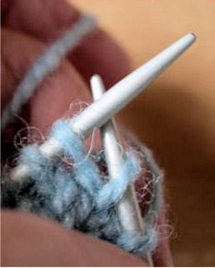
Right needle in stitch in row below (15)