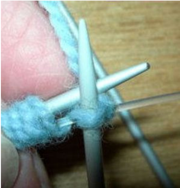
First Knit Wrap (4)

I place my bag of yarn in my lap. With opposite end of needle #1, knit wraps of first sock off left tip of needle #1. (Picture 4)