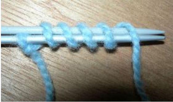
Starting Wrap (1)

Wrap both needles in this direction 8 times, which is half the total number of stitches you are casting on. Make a backward loop with the working yarn and place it on tip of needle #1 only.