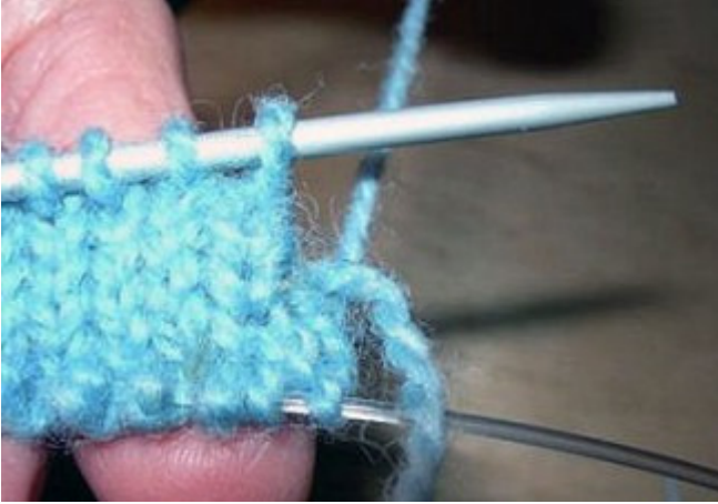
Cast on tail outside (9)

This way you are weaving in the tail as you go. When your knitting is approximately 1-1/2 inches long, discontinue the weaving in and out and leave the tail on the outside of your knitting. You neat knitters, avoid breaking off or cutting the tail. This acts as your marker. The tail is half way through a round, which makes the beginning of the round the edge without the tail.