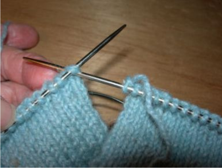
First sock yarn left on front (5)