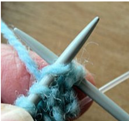
Insert right needle tip from left under left leg of bar (12)

Raised Bar or Running Yarn Left Increase: Yarn as it travels between two stitches is referred to as a bar or running yarn. From the front go under bar with tip of left needle