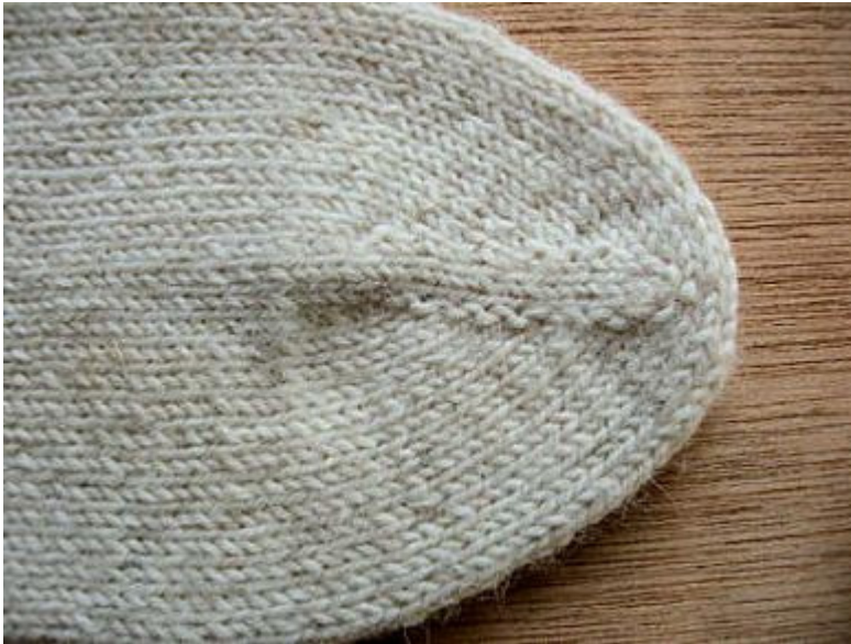
Sock Toe (10)

Toe Increase: This increase has two stitches between the increases at each side of the sock. (Picture 10)