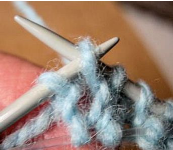
Insert right needle tip from right (14)

Knit in the Row Below Right Increase: Insert right needle tip from the right under right leg of stitch in row below. Place stitch onto left needle by inserting tip of left needle through center of stitch and in front of right needle. Knit stitch onto right needle. (It is a twisted stitch.) Knit stitch above stitch just knit. (Picture 15)