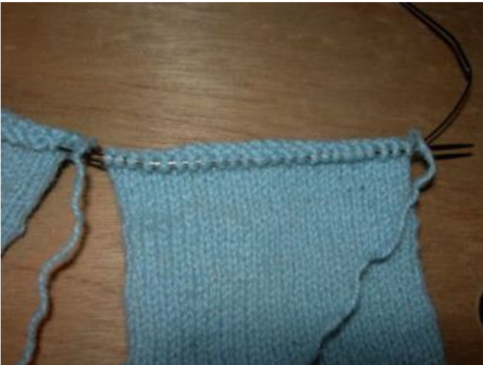
Yarns brought forward from back needle in position to be knit with front needle (6)

Remove backward loop made with sock 2 yarn from left tip of needle #1 and with sock 2 yarn, knit across the wraps for sock 2. Slide needle #1 so all stitches are on the flexible portion.