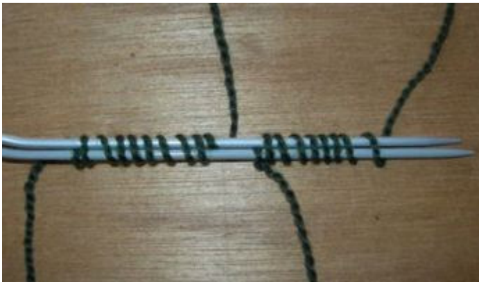
Wrapping Complete (2)

With second ball of yarn make a slip knot as before and place on needle #2. As just previously done, wrap both needles from back to front 8 times. (Picture 2)