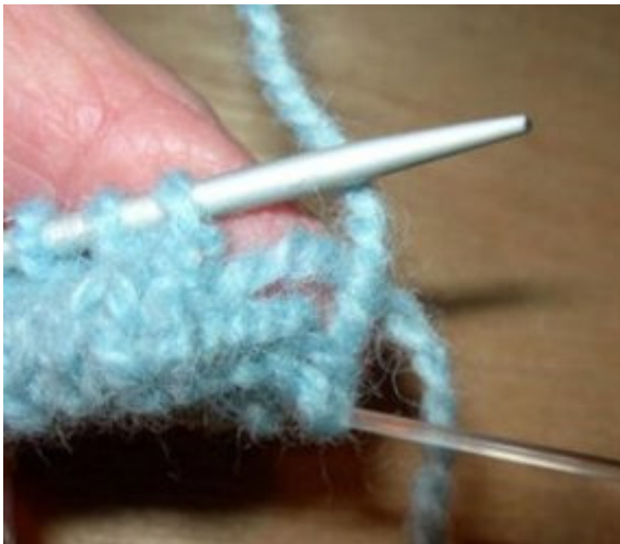
Cast on tail inside (8)

As you continue knitting around, place the cast on tail first to the inside of your knitting, and next round place it on the outside of your knitting. (Picture 8 and 9)